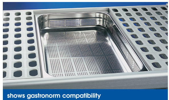
shows gastronorm compatibility