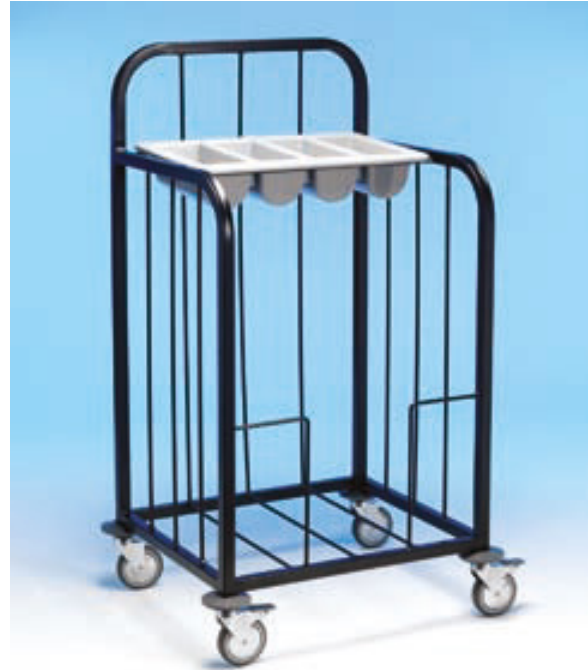
shows single tray model